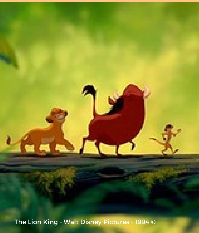
The Lion King - Walt Disney Pictures - 1994 ©

CHANGE: Simba learns and accepts in adulthood his identity and his responsibilities.